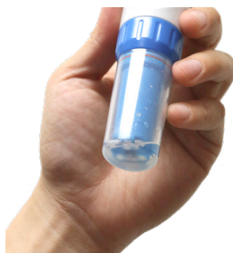
Micro-Volume pH Test