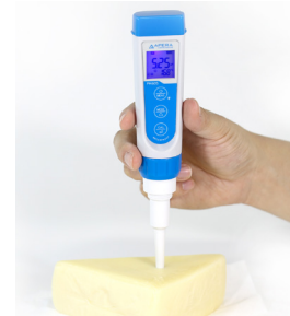
Food pH Test