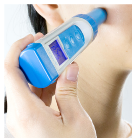
Skin pH Test