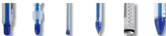
Hemispherical Cylindrical Slim Spear Flat Conical